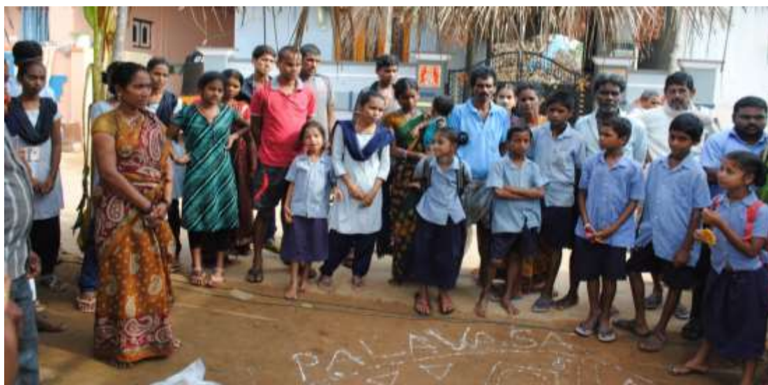
School students from Palavalasa Gram Pannchayat took part in community mapping excersice

Most of the school dropouts in the Mandal happen to be girls. Very few girls study beyond the 10th standard. This is an issue in Anandapuram, Vellanki, Mamdilova, Gandigundam and Sontyam. The reasons given were primarily those involving the inability to afford school fees, child marriage and transportation. In Mutcherla, only 10% of girls continue after the 10th standard, particularly because of transportation issues.