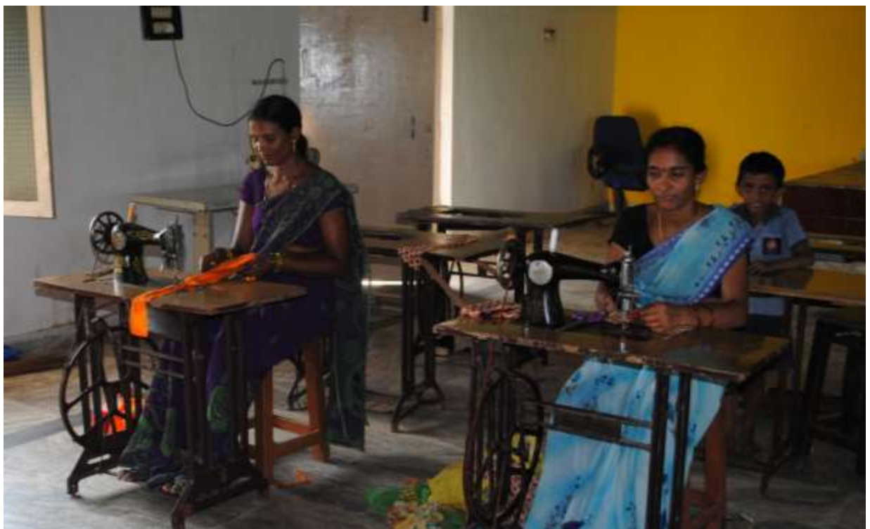
Tailoring training session for women from the Boni Gram Panchayat

Livelihood is key for having access to the basic necessities and an enjoyable standard of living. The main livelihood areas of need in the Mandal involve Self-Help Groups (SHGs), additional livelihood options, and additional skill development opportunities. The main sources of income in the Mandal are daily wage labour and agricultural work. Many people in the Mandal also rely on other income sources, such as pensions. The Mandal has 1,125 SHGs, with 13,834 members, which is almost 23% of the population of Anandapuram. There has been a record of 1,428 linkages of SHGs with one or more types of finance—0% bank linkage, Shree Nidhi linkage, scholarships or any other linkages. There are a total of 5,859 residents availing pensions in the Mandal from OAP, widow, PHC, toddy tappers, weavers, and Abhayastam categories. This means that approximately 10% of the population avails pension facilities. Under the Mahatma Gandhi National Rural Employment Guarantee Scheme, there is a total of 9,948 job card holders in the Mandal. An estimated 90% of the population in the Mandal aspiring for job cards have been given job cards, yet in the Anandapuram Gram Panchayat, a need for additional job cards was voiced. There are 9,453 job seekers and 1,026 families who have completed 100 days of employment under MNREGA. There are 668 SSS groups under MNREGA.