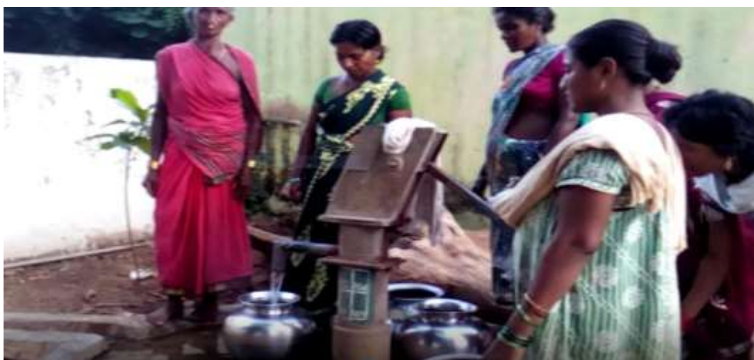
Women from Boni Gram Pnchayat taking water..

Thirty per cent of the Mandal has prioritised water issues in their top three areas of need. Out of these, issues of lack of individual household taps and water connections was an identified prioritised need in Mutcherla, Pekeru, Vellanki, Mukundapuram and LV Palem. In terms of quality of water, the gram panchayats of Mutcherla (both access and quality), Gandigundam, Gidijala, and Pandalapaka identified prioritised issues with the poor quality of drinking water available. Household connections of water are described by local officials as being difficult to achieve due to water capacity of the water tanks, therefore, this may need to be implemented along with increased number of water tanks. As a Mandal, about 30% of the gram panchayats prioritised water as their top area of need, while the remaining 70% did not. By addressing the issues of both access and quality in 30% of the Mandal, 100% saturation can be met.