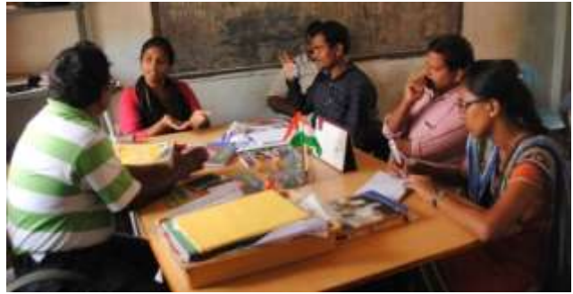
Focus group discussion on women issues at Boni Gram Panchyat

The entire population of Anadapuram is divided into a number of socio-economic and political strata. Hence, different groups may not be initially comfortable in sharing their concerns and suggestions in the presence of others. Thus, to facilitate sharing from all community strata, small group discussions were separately organised. Such groups included those of children, women, NGOs, youth, senior citizens, SCs and other such homogenous categories. Their concerns and suggestions for the development of their villages and of the Mandal were recorded to ensure that their voices are included during the collective envisioning process.