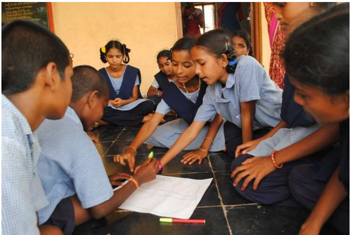
School students actively involved in a discussion on their village mapping.

all necessary infrastructure, including compound walls and playgrounds with sufficient classrooms. The government schools will have high enrolment and zero dropouts for both girls and boys. There will be a PHC Centre with 30 hospital beds and each sub-centre will be in good condition with quality care. In other words, quality healthcare will be accessible to every resident of the Mandal. AWCs will be sufficient in numbers, providing quality care, with proper infrastructure and facilities. In addition, girls and women will be safe from sexual harassment as well as from child marriages. There will be homes for all, and everyone will have access to every necessary civic infrastructure, such as electricity and water connections in their homes. Livelihood options will be sustainable, diverse and plentiful with opportunities for skill development. Overall, Mandal community members will live a holistic and enjoyable life with their basic needs met and opportunities for furthering their education and careers. High quality of life for every child and adult will result in an engaged, motivated and healthy citizenry living in a 'Smart' as well as a 'Child Friendly' Anandapuram Mandal.